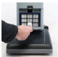
Industry-leading 3-stage sealed H.E.P.A. filtration for improved IAQ