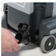
Easy access to clogs, minimizing potential downtime