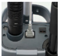
Detachable power cable for quick service