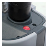
Airflow indicator light shows when bag is full or vacuum is clogged